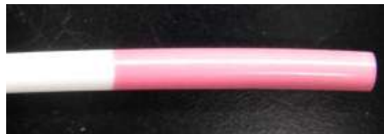
A uniform hydrophilic coating is shown on a PhotoPrime™ SR catheter. The hydrophilic coating only adhered to the primed region as shown by staining in red